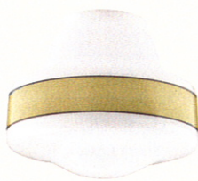
375GN $35 W: 8-1/2", H: 7" Shiny Opal