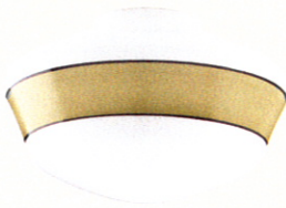
301GN-8 $29 W: 8", H: 6-1/2" Shiny Opal