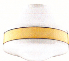
375TN $35 W: 8-1/2", H: 7" Shiny Opal

OUR FAMILY OF ART DECO-ERA PAINTED SHADES (here and on pages 44 and 50) evoke the color and playful spirit of the 1920s and '30s. Offered in Green and Tan and a range of coordinating sizes, these shades add period fun to kitchens, bathrooms, and any room with a less formal look. Note that the hand-painted colors vary, and look different lit and unlit.