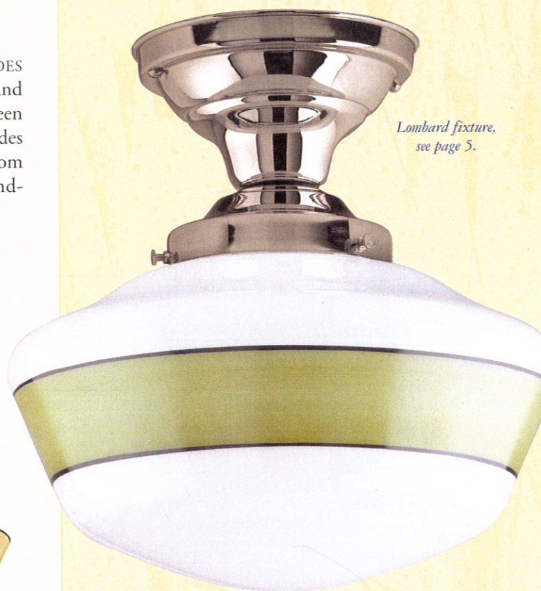
Lombard fixture, see page 5.