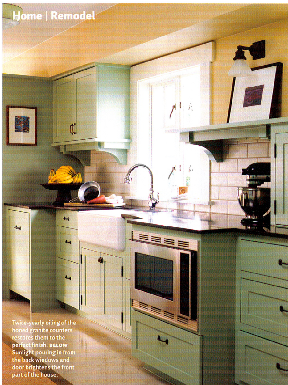
Twice-yearly oiling of the honed granite counters restores them to the perfect finish. BELOW Sunlight pouring in from the back windows and door brightens the front part of the house.